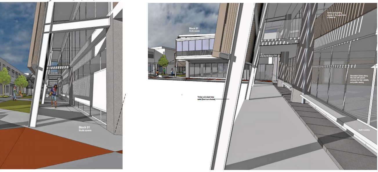
Architect impression of the west view of building "one"