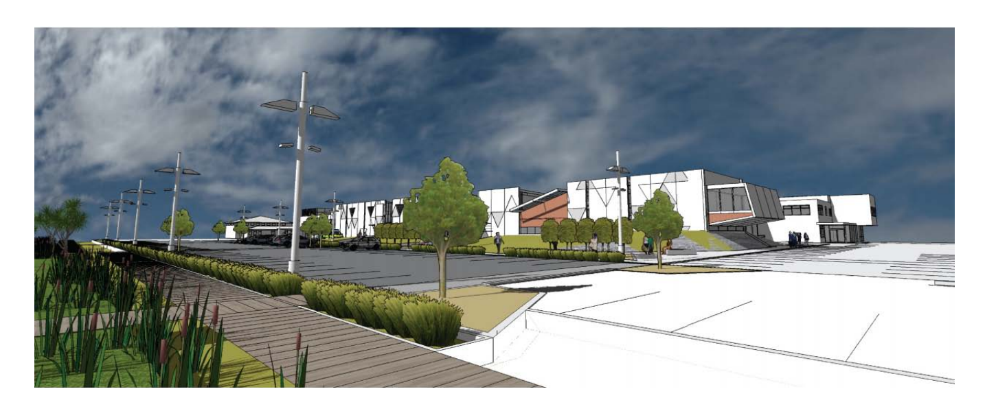
Architect impression of the west edge view of building "one"