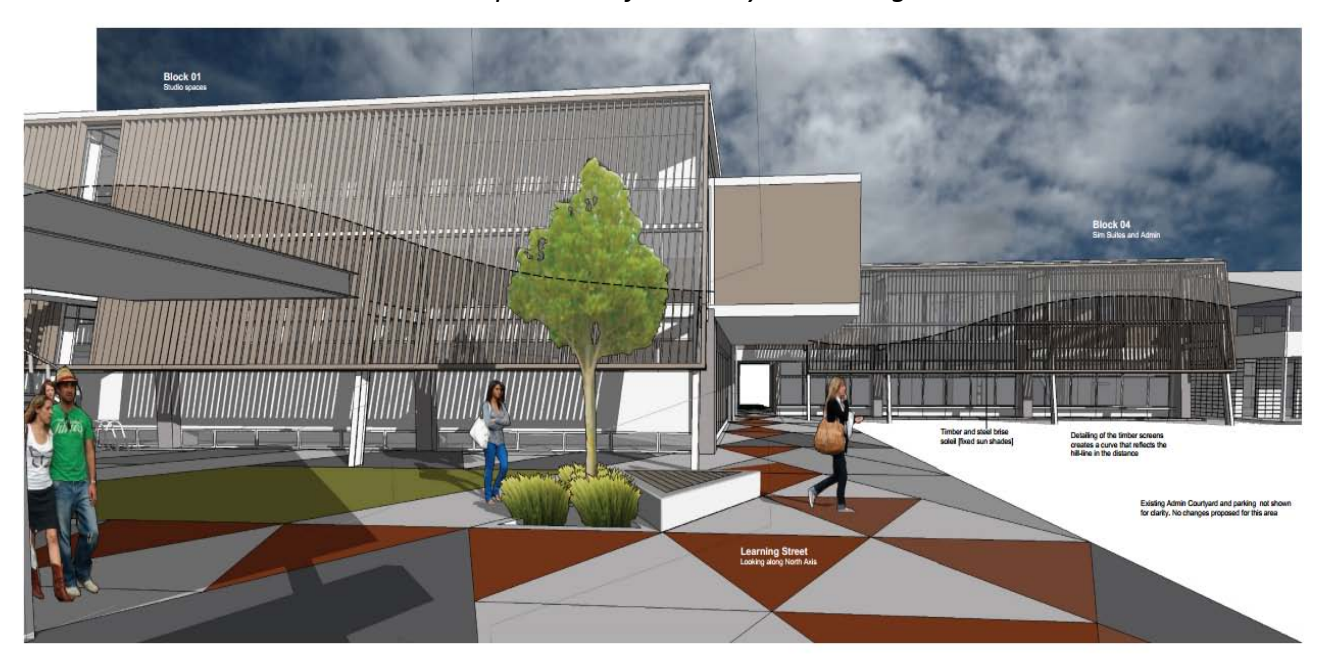
Architect impression of the north view of building "one"