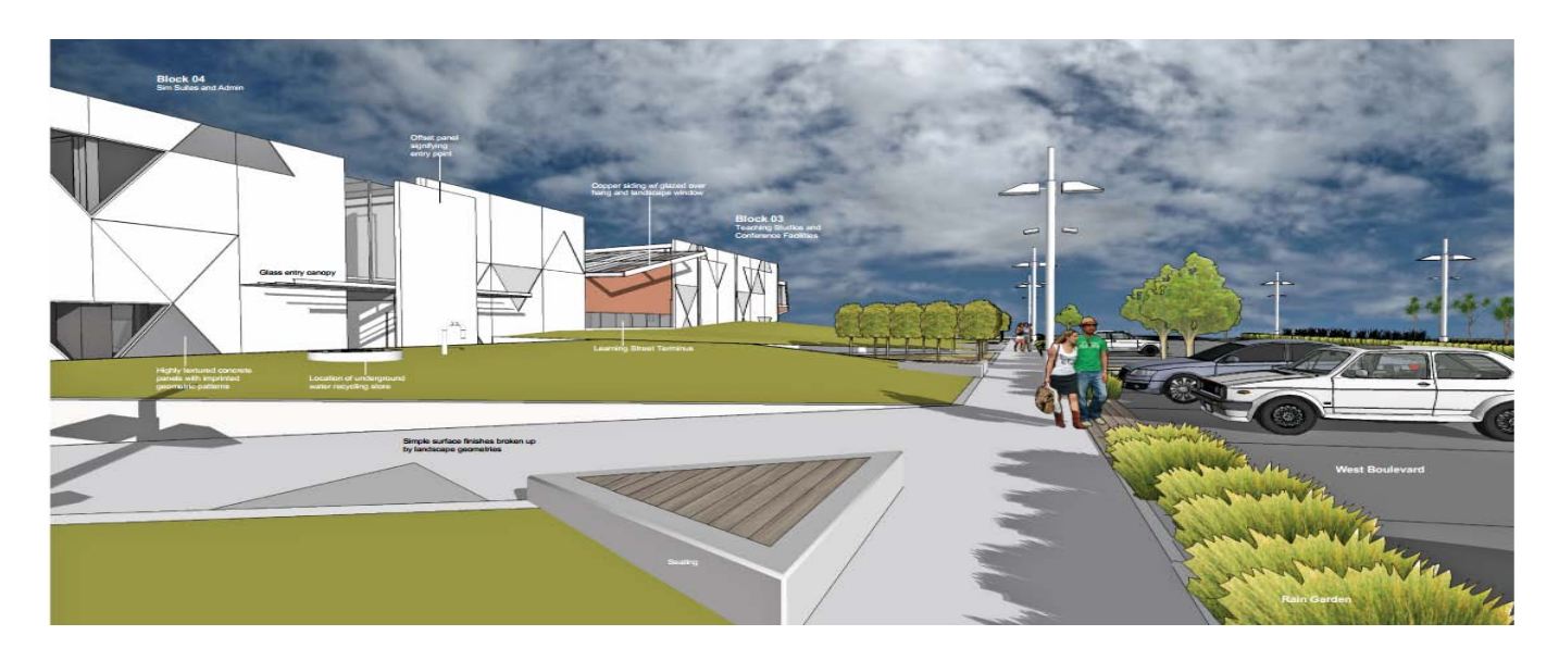
Architect impression of the west edge view of building "one"