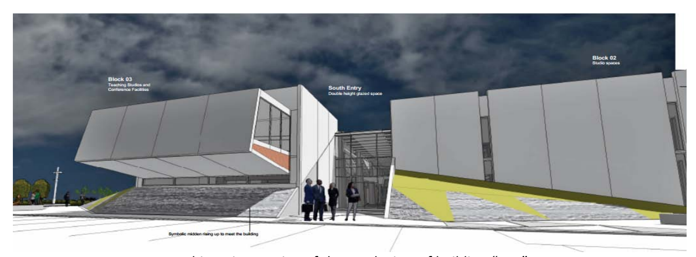
Architect impression of the south view of building "one"