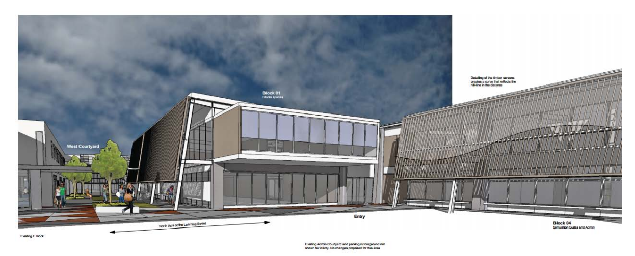
Architect impression of the entry to building "one"